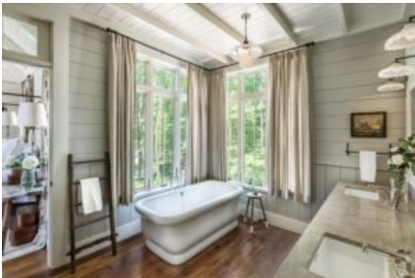
BALA winner Lake Keowee Cottage.

In single-family custom and production homes, architects and designers include benches and nooks because they're cozy, chic and practical, serving as places to snuggle up with the kids or a good book.